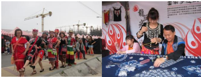
Figure 5: (a) The Migan Festival- featuring traditional Yunnanese music. ; (b) The Migan Festival- Yunnan folk activities.

regular gatherings, to construct memories and imaginings of this strange land through a collective dance and music experience. The music also expressed and displayed the characteristics of their ethnic culture, rebuilding a diaspora identity based on the diaspora experience. In recent years, the government has stepped up efforts to collect oral histories of veteran communities and conduct other cultural and settlement surveys, in the name of a renaissance of veteran community culture. Cultural festivals such as the Military Housing Culture Festival have also been held. In 2011, the Longgang Migan Festival began, featuring traditional Yunnanese music, patriotic song performances and Yunnan folk activities. (Fig. 5ab). In 2014, the original celebration of food was expanded to include the Torch Festival celebrated by ethnic minority in Yunnan and the Songkran festival celebrated in Thailand. The two-week festival brought together the food, music, clothing, and activities of many cultures, and many people from outside visited. A more inclusive food landscape was constructed, gradually opening the closed cultural circle.