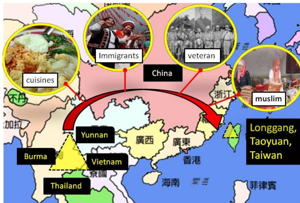
Figure 3: The History of migration in the golden triangle.

Burmese minorities. In order to house these soldiers and their dependents, who totaled over 10,000 in number, the government chose the Longgang area located between the cities of Zhongli, Pingzhen, and Bade in Taoyuan County to build veteran communities. The Ministry of Defense also gave the troops the unit name of Zhongzhen, "loyalty and faith," reflecting the spirit with which they undertook the hard journey from Yunnan and Burma. Interviews show that these displaced troops on the Chinese border were left to fend for themselves as they wandered through the mountains of the Golden Triangle. A long period of migration was only concluded when a base for re-taking China was established on the border with Thailand and Burma. This experience of displacement and unrest in migration was embedded in the food and cultural habits these troops brought to Zhongzhen New Village. When they first arrived, these new migrants had difficulties adapting to life in Taiwan due to the unfamiliar language and environment. However, the bond of their shared experience in the Golden Triangle proved to be a tight connection that eventually gave rise to a cultural identity. (Fig. 3).