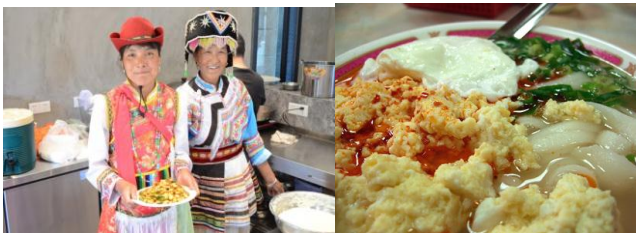
Figure 2: (a) Migan is a representative dish of Longgang ; (b)Traditional Yunnan minority clothing on display in a Yunnan-inspired shop.