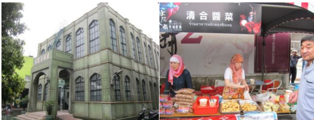
Figure 4: (a) Longgang's mosque ; (b) A Muslim restaurant sets up a stall in a festival to sell snacks and dried food.

Taking food as an example, Muslims observe dietary restrictions and have strict requirements on how animals are killed and processed for food. Responding to the general lack of Muslim-oriented food options in Taiwan, halal-certified restaurants have emerged in Longgang. (Fig. 4b). The owners of these restaurants are not always Muslim themselves, but they provide food that is acceptable to Muslims, for whom these dishes and ingredients trigger nostalgia and memories of the familiar flavors of home. At the same time, the food has undergone localization, with ingredients, flavoring, and recipes adapted to local tastes. These dishes are not carbon copies of what Muslims would eat at home, but embedded in local relationships. Muslims come from different places, but they feel a sense of belonging through eating the same foods. The dining experience in Longgang's Muslim restaurants shapes a food landscape based on identity, resisting mainstream food trends. Food is a medium through which community connections are maintained.