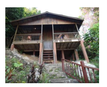
Figure 3(a): Timber chalet at Tioman Island