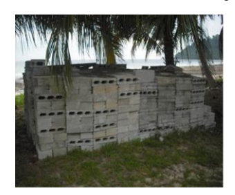
Figure 4(a): unused construction bricks on the beach at Tioman

However, solid waste management on the Tioman Island is less efficient due to the several reasons. The first one is small vessel capacity. Waste vessel only takes in domestic waste, not the construction waste. Therefore, all the construction waste or bulky waste such as broken boats, batteries, oil drums, fridges are thrown on the beach or at the chalet area.