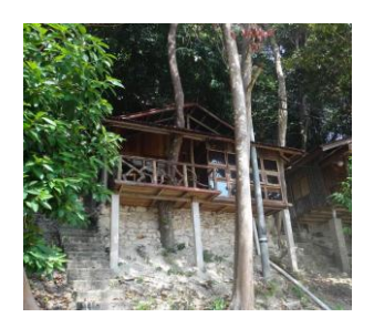
Figure 3(b): Timber chalet at Kapas Island

Other similar green practices were recycling of aluminium cans and cooking oil, use of energy saving bulbs, noise control from cafés and bars, linen drying using sunlight and reuse of products. Whereas, mineral bottles, TV, iron, carpets, fridge and shampoos are not provided in the guest rooms. The omission of this stuff able to save energy, water, waste and freshwater contamination.