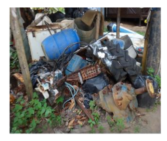
Figure 4(b): bulky waste on the beach at Tioman Island