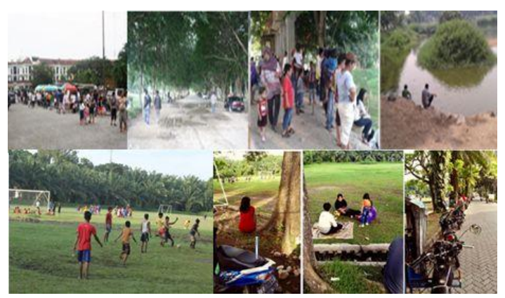
Figure 2. Public life in Cemara Asri Park (Top) and Setiabudi Square (Bottom)