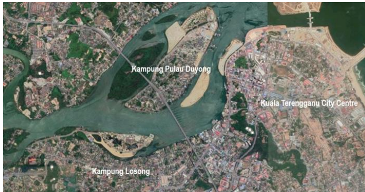
Figure 1: Map of the study area

Besar and the Pulau Duyong Kecil separated from each other by shallow river flows. However, due to land development and the construction of the Sultan Mahmud Bridge completed in 1990, the islands have been consolidated into one large island. The terrain shape of Pulau Duyong Kecil as a whole is a flat surface. To the east is Pulau Kambing. Pulau Duyong has strategic access that can connect either by land or by waterway. The island is about 2.7 square kilometres and has 686 houses. The locals maintain the Malay culture and way of life, with over 40% of the population working as fishermen.