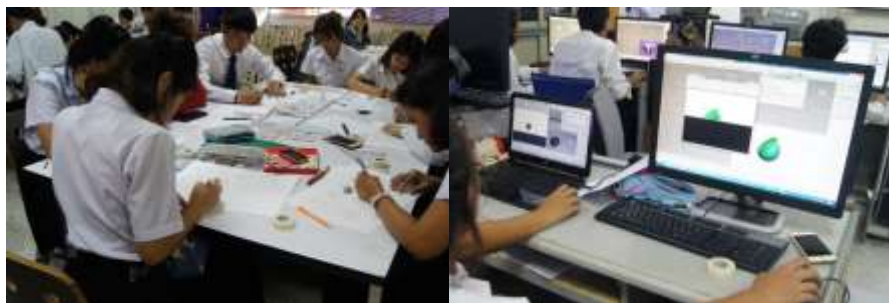
(a) (b) Figure 1: (a) Handmade design process; (b) Computer modelling process.

• Collecting the academic performance data (Transcript) of the 4th year undergraduate industrial design students and divided the students into groups by using Cluster Analysis to find the attitudes indication factors. Dividing the academic performance into two parts, the first part is the Grade Point Average (GPA) which can be divided the student according to their GPA into three groups; the group of students that have high GPA in industrial product design 1-3 class, sketching class, and painting techniques class and other classes that involve hand sketching will be classified as the classes that have an aptitude in handmade drafting. However, if the students have high GPA in industrial product design, 4-5 classes, computer for design and production classes and other classes that involve using computers to create the designs will be classified into the group that has an aptitude in using computer for design process